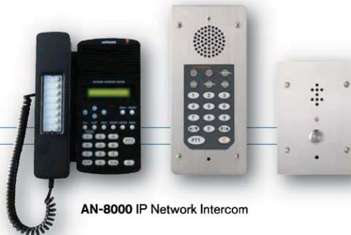
AN-8000 IP Network Intercom