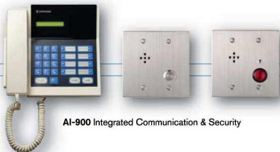
AI-900 Integrated Communication & Security

AX Series Integrated Audio/Video Security JF Series Hands-free Color Video AN-8000 IP Network Intercom KB Series Video Sentry Color Tilt MK Series Black & White Video Sentry IP-EWST IP Addressable Intercom Adaptor LEF Audio Open Voice Selective Call Systems LEM-1DL Access Sentry