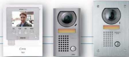
JF Series Hands-free Color Video