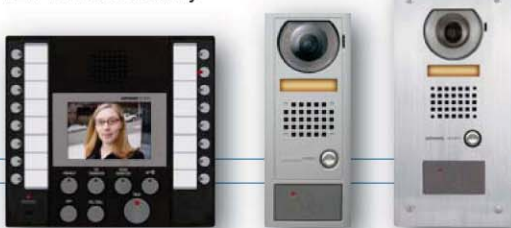
AX Series Integrated Audio/Video Security with Embedded HID® ProxPoint Plus® Card Readers